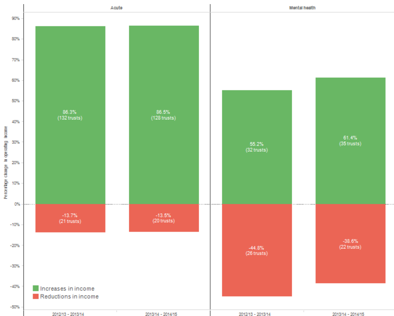
Figure 1 Percentage change in operating income for acute and mental health trusts