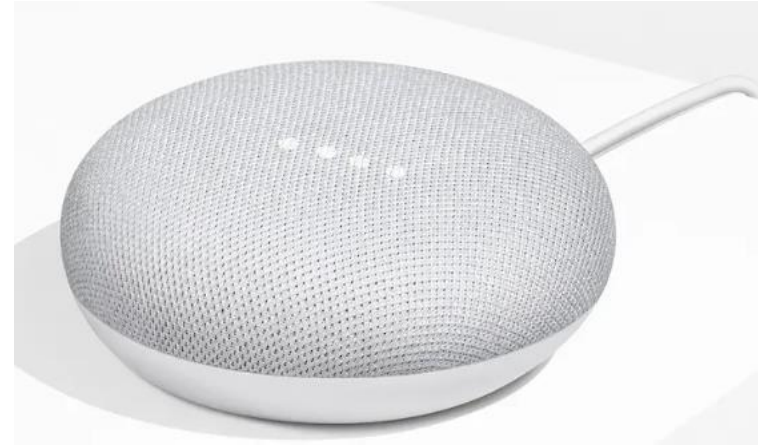
Google Home mini £50