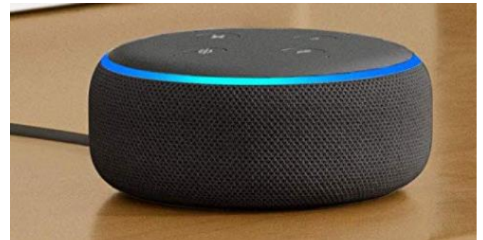
Echo dot £50